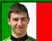
14 CABRINI FRANCESCO