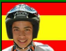
17 RIBA MARC